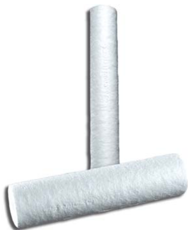
Figure 1: Purtrex Depth Cartridge Filters